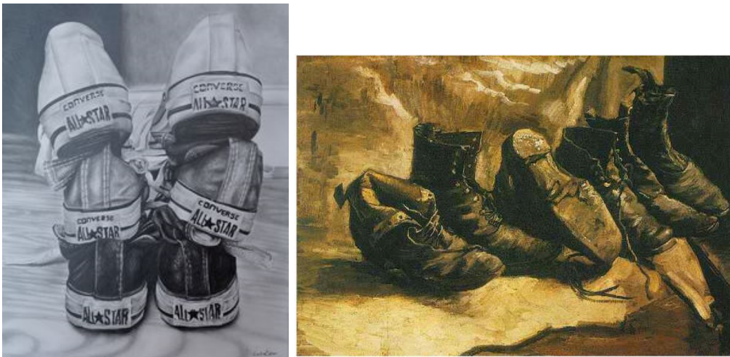
Vincent Van Gogh

Create a color rendering of a still-life arrangement consisting of your family member's shoes—try to convey some sense of each of your individual family member's distinct personalities in your piece. Mark-making is very important for juniors, and composition is very important for seniors. Acrylic paint.